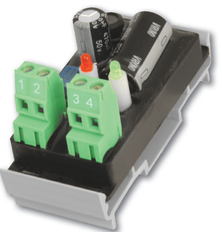
VC350A mounted in optional snaptrack

BAPI's voltage converter is a cost-effective way of converting 24 VAC or VDC to 5, 12, 15 or 24 VDC for use on peripheral devices that require DC voltage. The converter is available with a 350 mA output. The converter is very compact and designed to fit into standard 2.75" snaptrack.